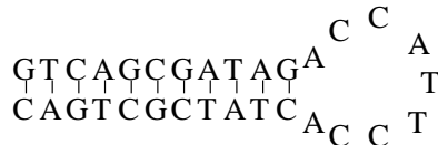
Fig. 1. If a word u is Watson-Crick bordered and its WK borders do not overlap, the word u may stick to itself forming a simple hairpin loop, as shown above.

been extensively studied in [2, 3, 5, 8, 9]. The notion of Watson-Crick bordered words was formalized and its coding properties as well as relations between Watson-Crick bordered words and other types of codes have been discussed in [11]. Certain algebraic properties of involution bordered words were discussed in [11]. In this paper we study the algebraic properties of the set of all Watson-Crick bordered words through their syntactic monoid.